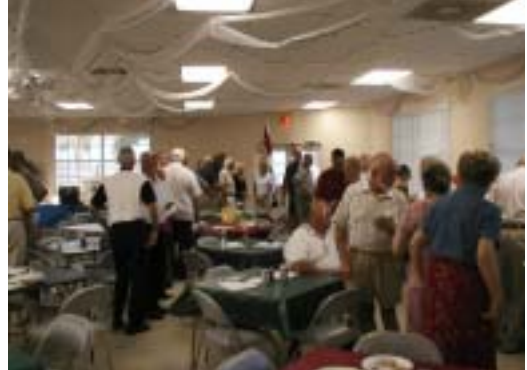
Pictured Above: Eating and Enjoying! Below: Checking out auction items.