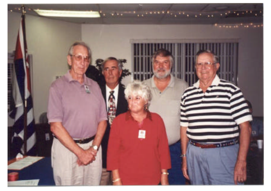
New members at the Holiday Meeting

Please welcome our new CBPS members! Add this information to your rosters.