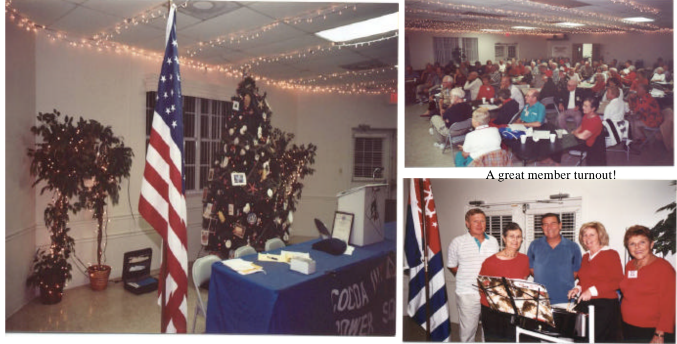
A Holiday welcome from the Bridge.