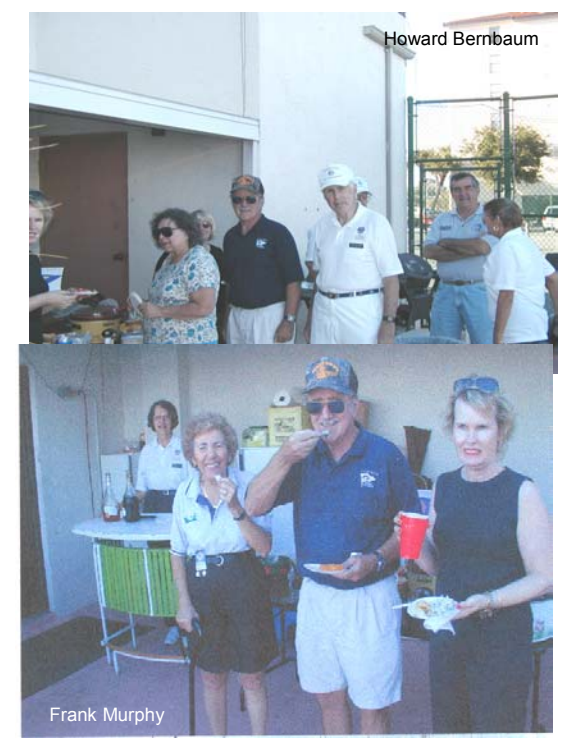
Our thanks to the Titusville Power Squadron. We all had a real good time.