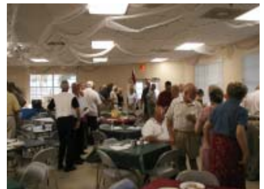
Pictured Above: Eating and Enjoying! Below: Checking out auction items.