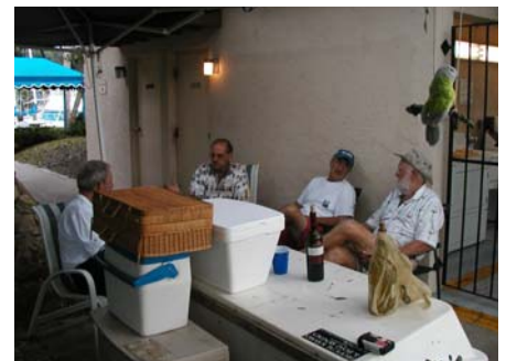
Why is it that the men sit in one spot and the women in another?