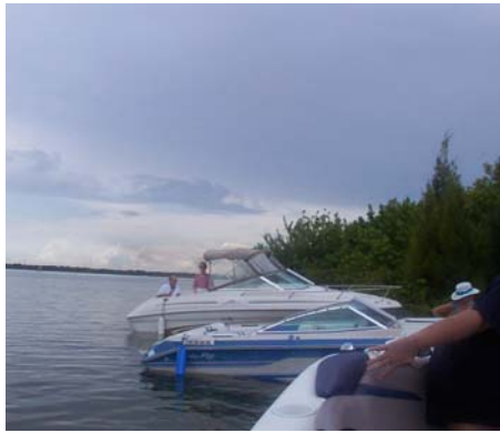
Looks pretty overcast, doesn't it?

The happy CBPS members are pictured to the right.